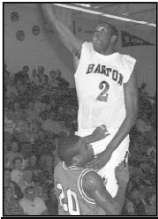
Ebi Ere 2nd Team 2001