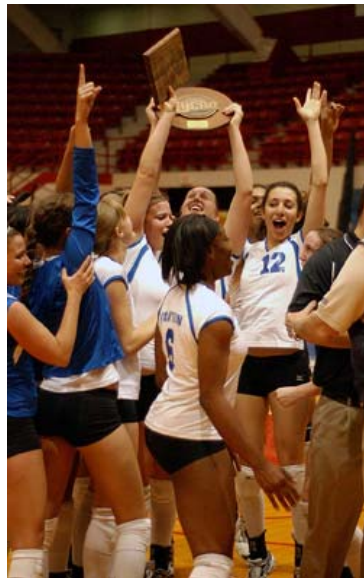
Jayhawk West Champs Region VI Champs 9 th Place in nation

The Barton volleyball team returned with vengeance this past season. They captured the Jayhawk West with a perfect 8-0 record and went on to capture the Region VI title for the first time since 2003.