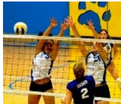
Finished 30-9 overall

The Barton volleyball team finished with the second best record in Jayhawk West. The Lady Cougars were 7-1 in the West, and 30-9 overall.